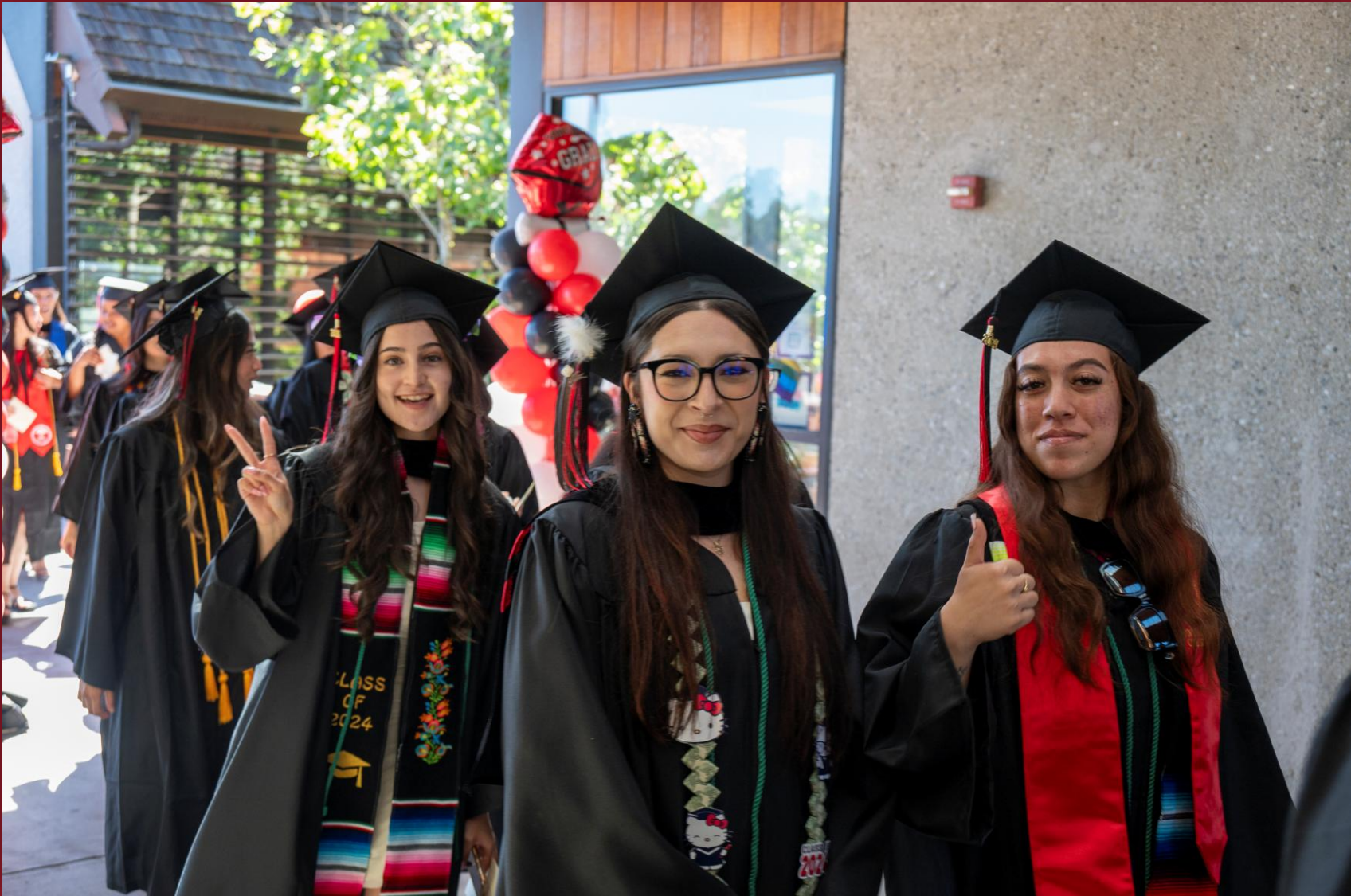
Challenge Team November 14, 2024